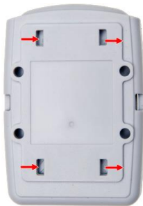
Strapping holes - pole