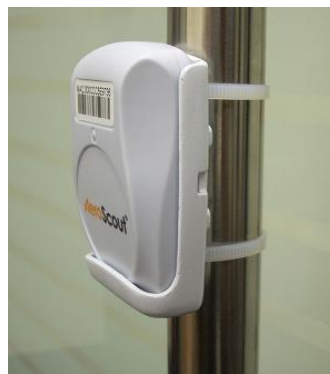
Tag attached to pole