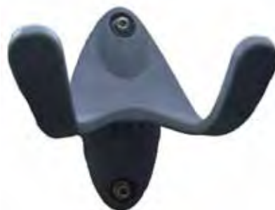
iSCAN100 Wall Mount Holster